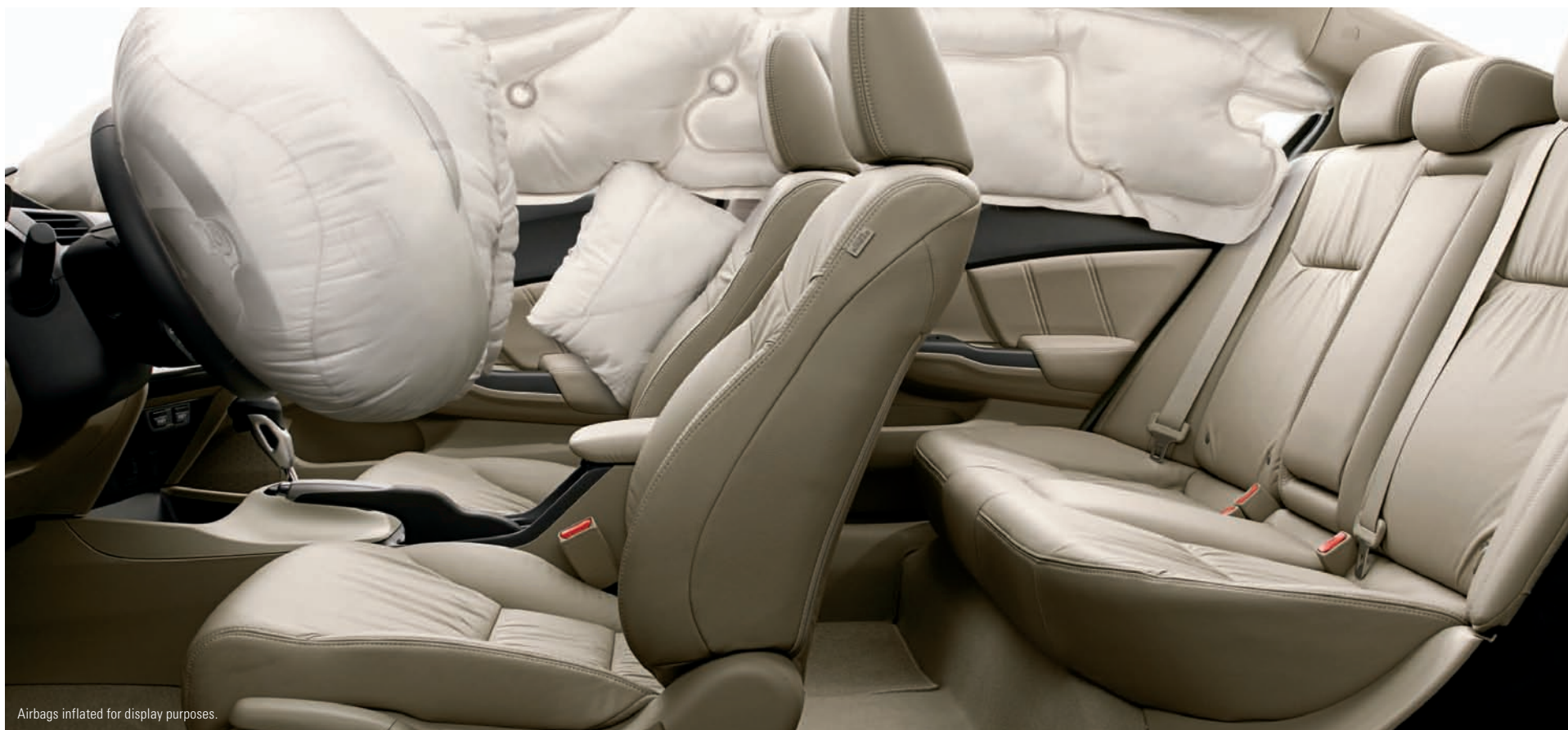
Airbags inflated for display purposes.

The Honda-exclusive Advanced Compatibility Engineering™ (ACE) body structure enhances occupant protection and crash compatibility in frontal collisions.