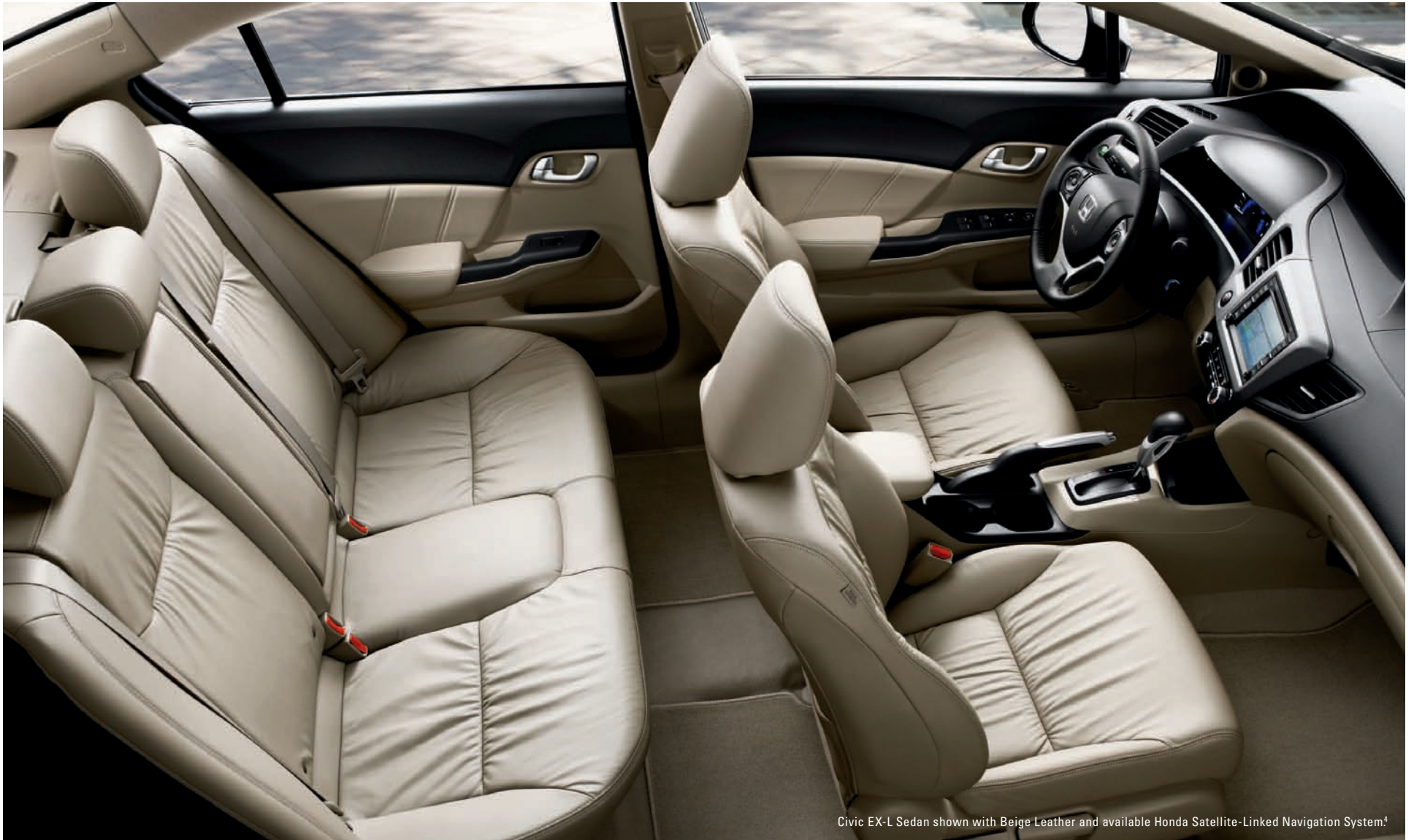
Civic EX-L Sedan shown with Beige Leather and available Honda Satellite-Linked Navigation System. 4

Escape pod? Command post? Personal sanctuary? All of the above? We outfitted Civic with thoughtful tools for a life on the go. How you use them is up to you. Your Civic will be what you make it.