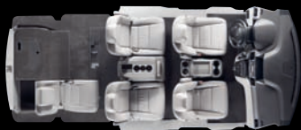
5-passenger cargo mode*

5 passengers and still plenty of cargo space.