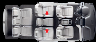
2nd-row "wide mode"

More space for passengers, or more room for 2 child seats in the 2nd row.