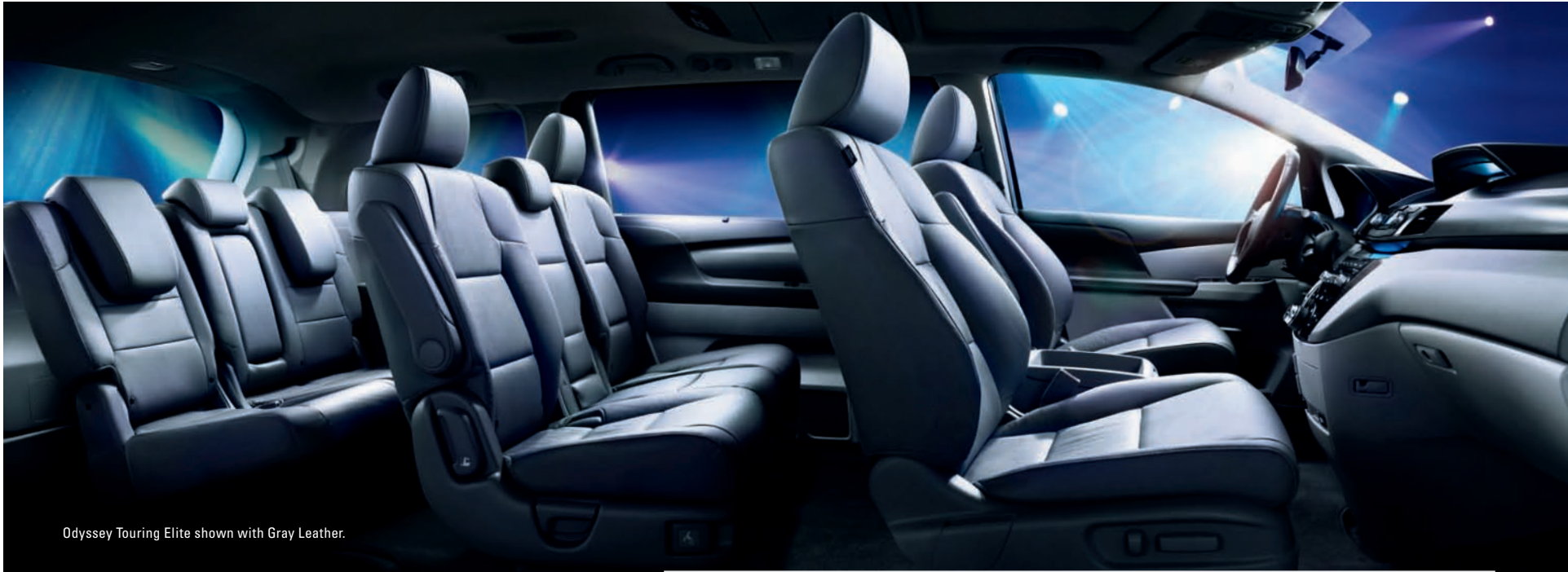
Odyssey Touring Elite shown with Gray Leather.