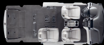
3-passenger cargo mode

The incredibly versatile interior easily adjusts to meet your needs.