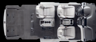
3-passenger cargo mode 2*

With 3 passengers, there's still plenty of room for a surfboard or ladder.