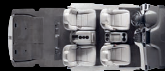
4-passenger cargo mode*

Party of 4? Stow the 3rd row for more cargo space.