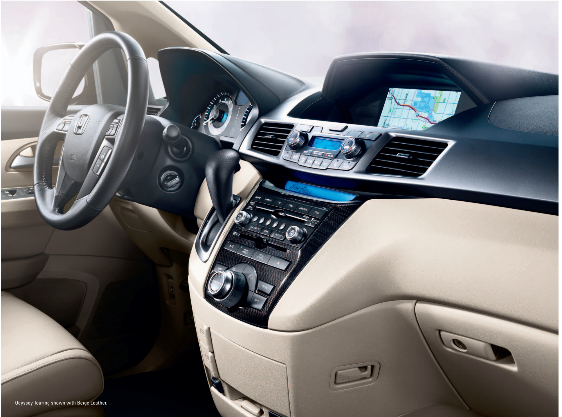
Odyssey Touring shown with Beige Leather.