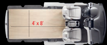
2-passenger cargo mode

4' x 8' sheets of plywood are a breeze to transport.