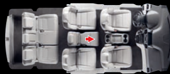
Multi-function center seat slides forward*

Quite possibly the perfect combination of cargo and passenger space.