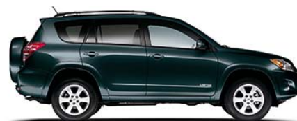
BLACK FOREST PEARL 3 Ash, Sand Beige or Dark Charcoal 1,2 interior