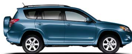
PACIFIC BLUE METALLIC 3 Ash, Sand Beige or Dark Charcoal 1,2 interior