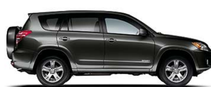
MAGNETIC GRAY METALLIC 1,2 Dark Charcoal 1,2 interior