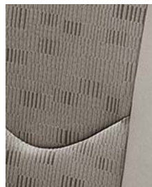
RAV4 fabric in Ash