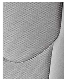
RAV4 available/Limited standard fabric in Ash