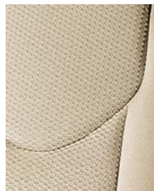
RAV4 available/Limited standard fabric in Sand Beige