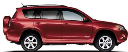
BARCELONA RED METALLIC Ash, Sand Beige or Dark Charcoal 1,2 interior