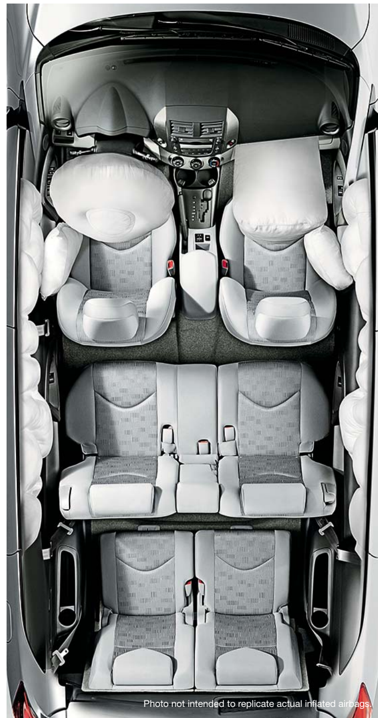
Photo not intended to replicate actual inflated airbags.

Six. RAV4 comes standard with an Advanced Airbag System that includes both driver and front passenger airbags and is complemented by front seat-mounted side airbags as well as first- and second-row Roll-Sensing side Curtain Airbags (RSCA).