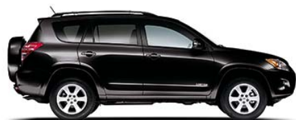
BLACK Ash, Sand Beige or Dark Charcoal 1,2 interior