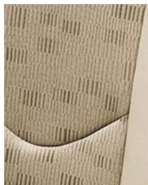
RAV4 fabric in Sand Beige