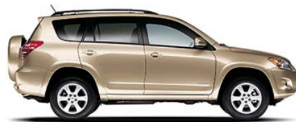
SANDY BEACH METALLIC 4 Sand Beige interior