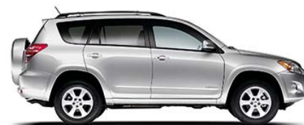
CLASSIC SILVER METALLIC Ash or Dark Charcoal 1,2 interior