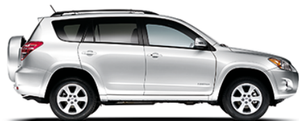
BLIZZARD PEARL 2,4,5 Ash or Sand Beige interior