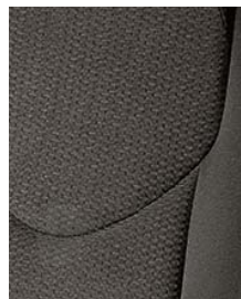
Sport fabric in Dark Charcoal