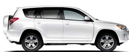
SUPER WHITE 1,3 Ash, Sand Beige or Dark Charcoal 1,2 interior