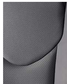
Sport leather in Dark Charcoal