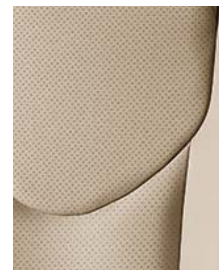
Limited leather in Sand Beige