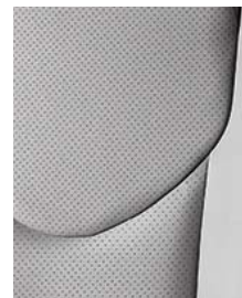
Limited leather in Ash