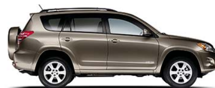
PYRITE MICA 4 Ash or Sand Beige interior